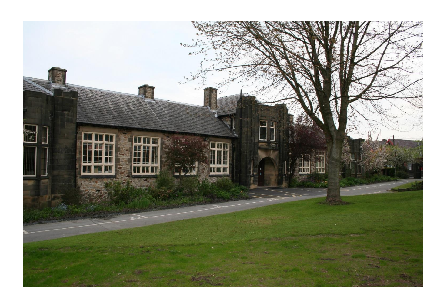
New Mills School